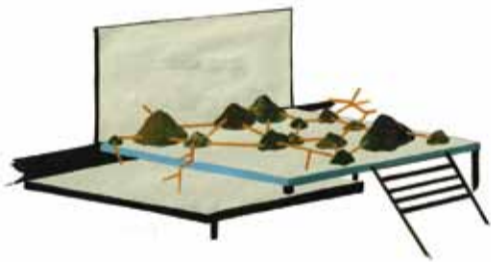
Octobong Nkanga , Contained Measures Series , 2008, acrylic on paper, 29.7 x 21 cm.

Antoni Muntadas's work explores questions of politics, communication, and the relation between private and public space. Muntadas began his project On Translation in 1995 and has explored issues of interpretation and translation internationally since then in more than thirty works. On Translation: Miedo/Jauf was filmed between Tarifa and Tangier in 2007 and focuses on the border between Spain and Morocco. While the work draws on some found images and texts, it is primarily based on interviews conducted by the artist with the inhabitants of both sides of the Straits of Gibraltar about the concept of fear. Muntadas's solo and collaborative works have been exhibited widely throughout the world, both in public spaces, such as television, billboards, and the internet, and in exhibitions. He is currently a professor at the Massachusetts Institute of Technology (MIT).