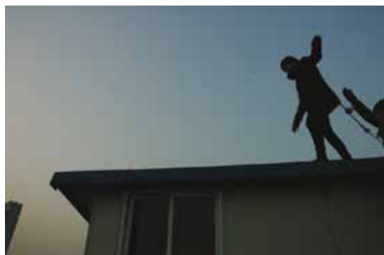
Part-time Suite , Loop the Loop , 2009, video of a performance, 7'31".

Octobong Nkanga is both a performer and visual artist working with installation, photography, drawing and sculpture. In her work, humans and alternately imposing and claustrophobic environments seem fragile; yet, for all of the fear or foreboding, there remain notes of hope. Nkanga's work often addresses political realities and considers changing economies, mobility, and displacement, especially in her home country of Nigeria. In her work Contained Measures Series , Nkanga presents painted drawings that set up connections between bodies, man-made structures and mountainous terrains, reflective of the delicate relationship between man and his environment and in line with the ambitions of the exhibition project as a whole.