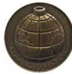
Mona Hatoum, Medal of dishonour, 2008, bronze, 9 x 65 mm diameter.