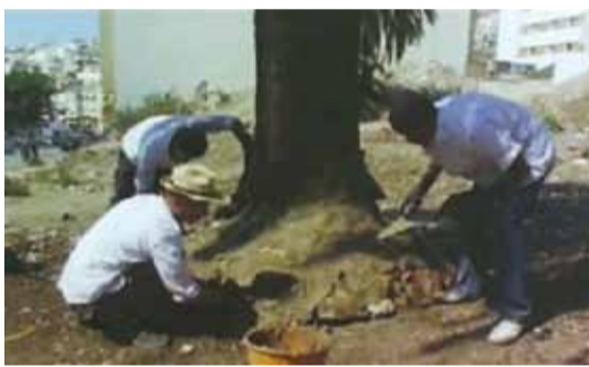
Yto Barrada , Beau Geste , 2009, 16mm film transferred to DVD, 3', English with Arabic subtitles. Courtesy of the artist. Co-production of L'appartement 22 and the artist, with the support of the Goethe Institut, Morocco.

Hamdi Attia's experimental approach explores associations and misrepresentations, and calls critical attention to the artist's role within society. In the collaborative and multistage project World Map , developed since 2004, Hamdi Attia analyzes the construction of geographic realities and proposes what comes across as a projection of other possibilities. In Archipelago, a World Map , the visual elements are inspired by the fluidity of transitional geopolitical realities that are simultaneously ultra-controlled. In the first version of the work, installed at the Hordaland Art Centre in 2010, the artist created a paradox by producing a seemingly free world map without grids, presenting it in the form of self-enclosed masses that float as disconnected islands.