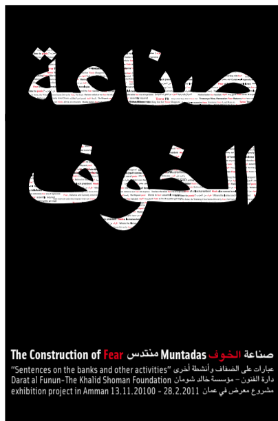
Antoni Muntadas, On Translation: Miedo/Jauf, 2007-2010, video, prints, and text on wall.

Antoni Muntadas's work explores questions of politics, communication, and the relation between private and public space. Muntadas began his project On Translation in 1995 and has explored issues of interpretation and translation internationally since then in more than thirty works. On Translation: Miedo/Jauf was filmed between Tarifa and Tangier in 2007 and focuses on the border between Spain and Morocco. While the work draws on some found images and texts, it is primarily based on interviews conducted by the artist with the inhabitants of both sides of the Straits of Gibraltar about the concept of fear. Muntadas's solo and collaborative works have been exhibited widely throughout the world, both in public spaces, such as television, billboards, and the internet, and in exhibitions. He is currently a professor at the Massachusetts Institute of Technology (MIT).