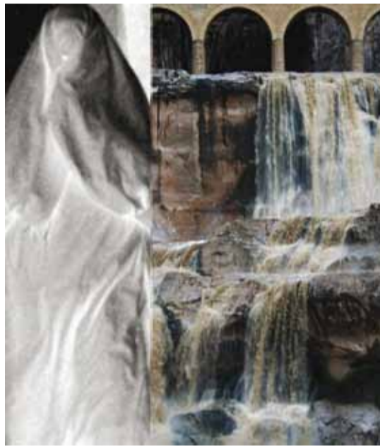
Catherine Poncin , Vertiges , 2006, color print mounted on diasec.

lyrical installations and performances. Filmed on a roof in the old market area in the centre of Seoul, Loop the Loop is a video of a performance in which the three members of Part-time Suite walk on the roof's edge, connected to one another by rope and by holding each other's hands. The performance, accompanied by music by the artists themselves, reveals their common destiny, the shared risk of falling, and documents a moment of mutual trust and cooperation. The members' only attachment to life is the other members of the collective, and as such the work proposes an experimental way of thinking about collaboration.